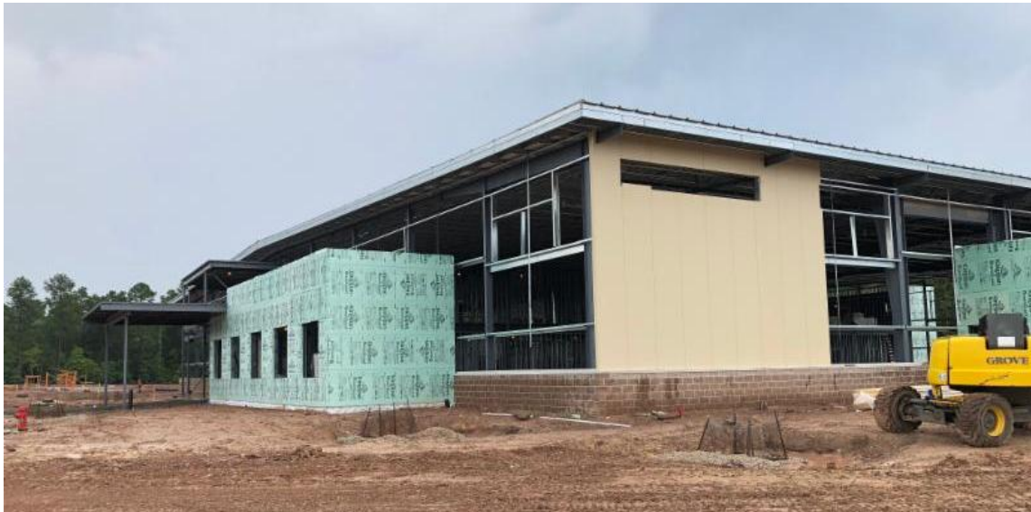
WCC Volleyball Center

For photos of the Wake Competition Center Preview facilities, activities, and attendees, check out our Flickr site by clicking here.