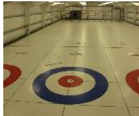
The Triangle Curling Center features four full-length Curling lanes

The Triangle Curling Club celebrated the Grand Opening of the region's newest Olympic sport venue, the Triangle Curling Center, by conducting a Grand Opening on April 25 and hosting a Housewarming Bonspiel, April 23-26. The Center is located at 2310 So Hi Drive in Durham and is designed for practice, training, and competition activities. The Center has been in planning and development for several years, and the Club's hard work and fundraising success have paid off with an exciting and unique facility. Visit the Triangle Curling Center and give the sport a try. You'll see why this favorite winter sport pastime is so fun, competitive, and addictive.