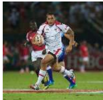
International men's Rugby action

For 21 international teams, the road to the 2016 Olympic Games in Rio de Janeiro, Brazil, includes major competition right here in the Triangle. The NACRA (North America and Caribbean Rugby Association) Sevens Championships will be held Saturday and Sunday, June 13 & 14, at WakeMed Soccer Park, where the top men's team and top women's team qualify for the 2016 Games. The Championships, which feature the high-scoring action of world-ranked seven-player teams, are being hosted by the Triangle Sports Commission in partnership with USA Rugby and the Town of Cary.