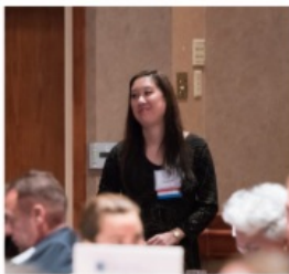
Diana Gee 1988, 1992 Olympics Table Tennis