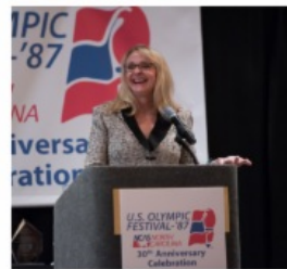
Nancy Hogshead-Makar 1984 Olympics Swimming