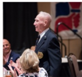
Guy Troy 1952 Olympics Modern Pentathlon