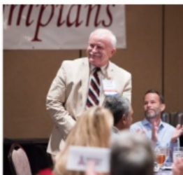
Jim Murray 1968, 1972, 1976 Olympics Luge