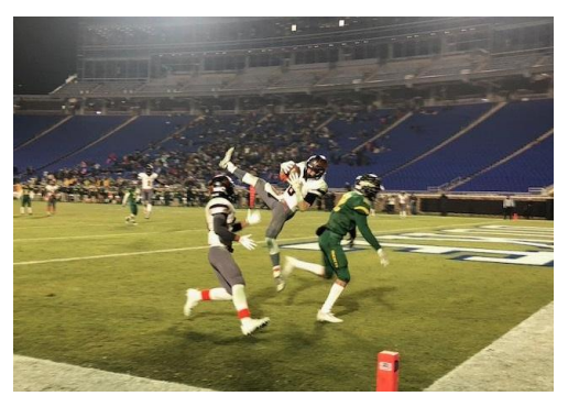
New Hanover's interception that sealed their win over AC Reynolds