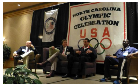
Olympic Coaches Luncheon