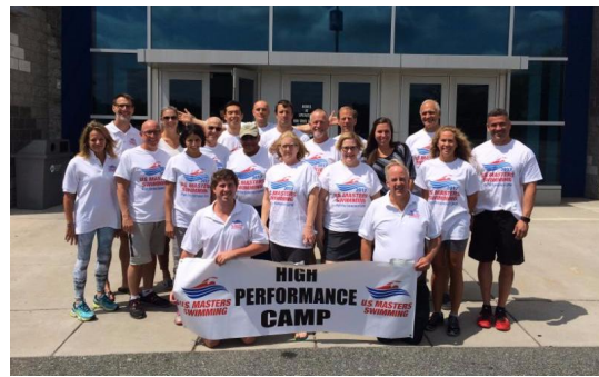
2017 USMS High Performance Camp

Similar to college applicants, if you are accepted into the USMS HPC Early Admission Process, you will be committed to attend the camp. (If, however, there is a documented significant injury or family crisis that arises later that prevents participation in the 2018 HPC, we will hold a slot for you in the 2019 HPC or you can apply for a refund.)